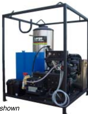
Model 5830D shown