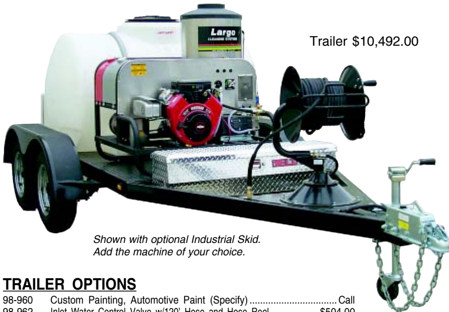
Shown with optional Industrial Skid. Add the machine of your choice.