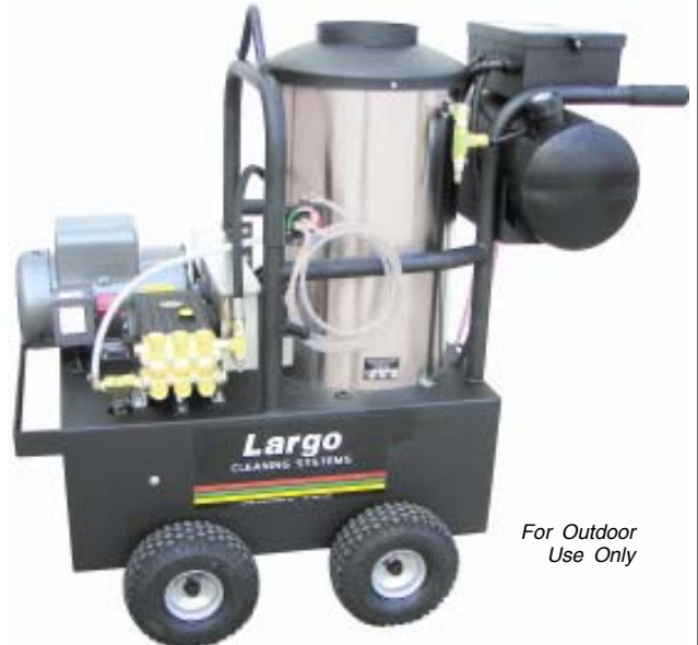
For Outdoor Use Only