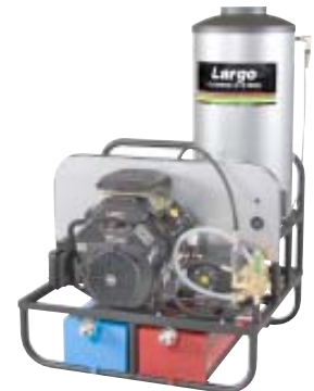
Model 5835 shown