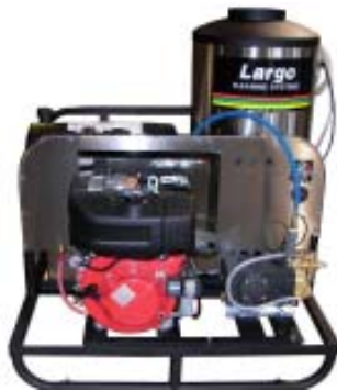
Model 5-4300D shown