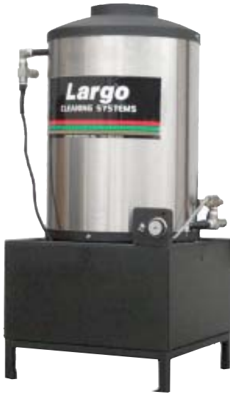
Model 973LP Shown