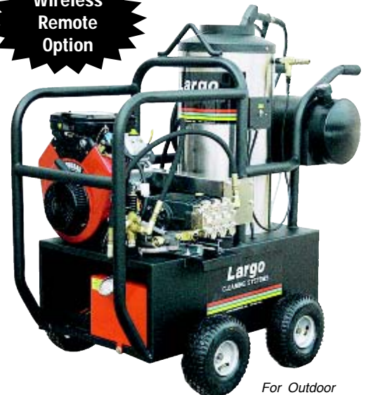
For Outdoor Use Only

Shown with Optional Front Roll Cage $185