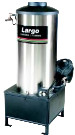
Model 98012 Shown