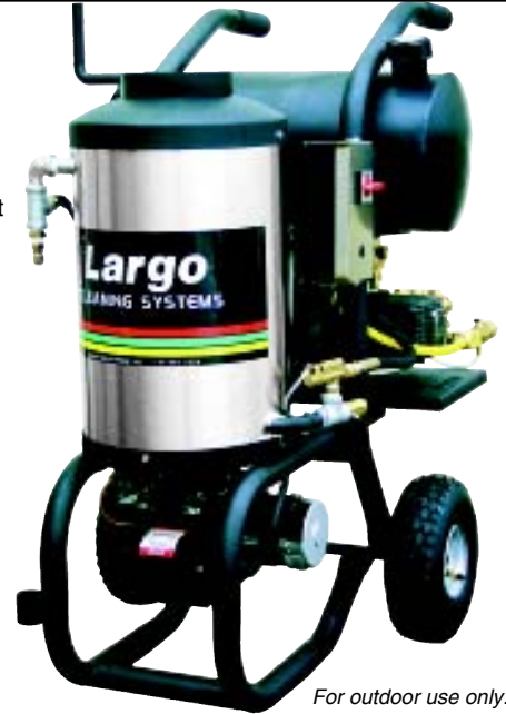
For outdoor use only.