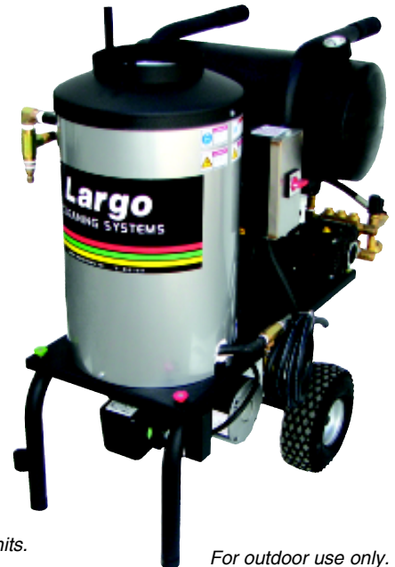
For outdoor use only.