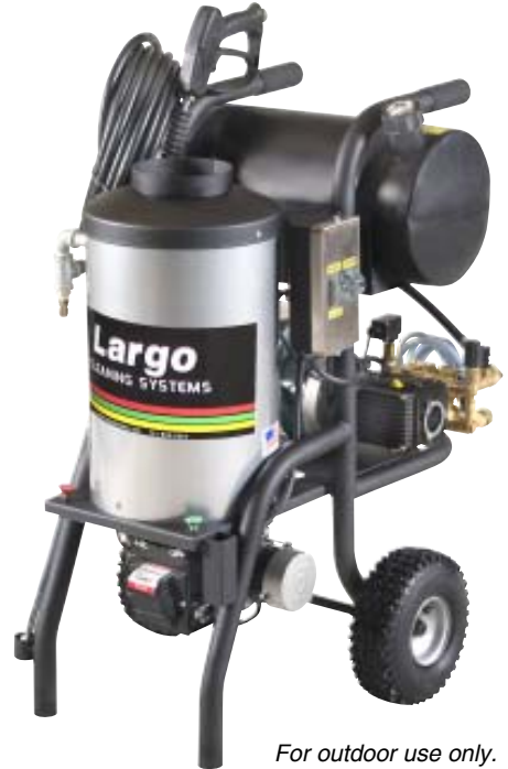
For outdoor use only.