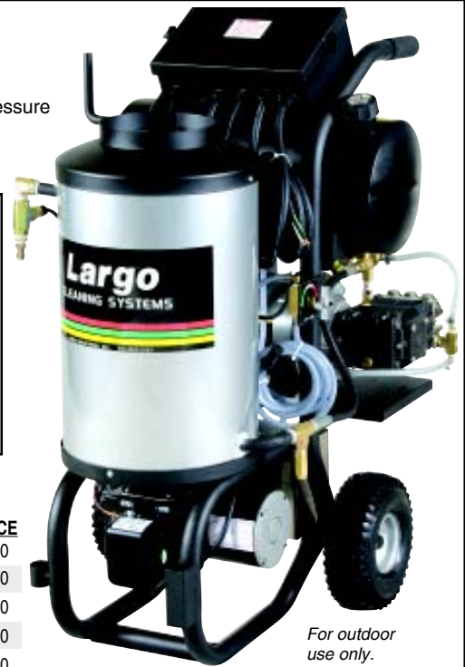
For outdoor use only.