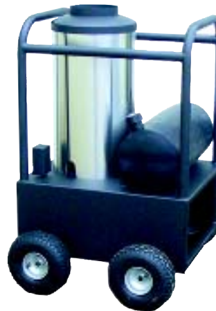
Model 98012-P Shown