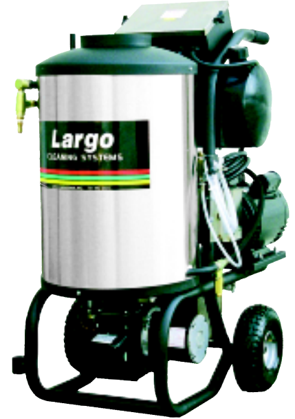
For outdoor use only.