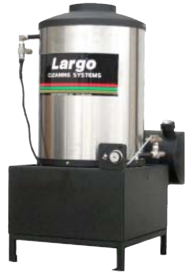
Model 94115 Shown