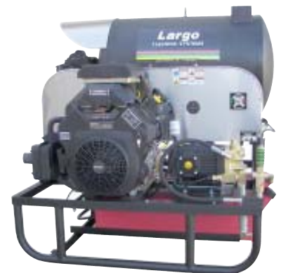
Model 5835HZG shown with optional End Mount Fuel Tank